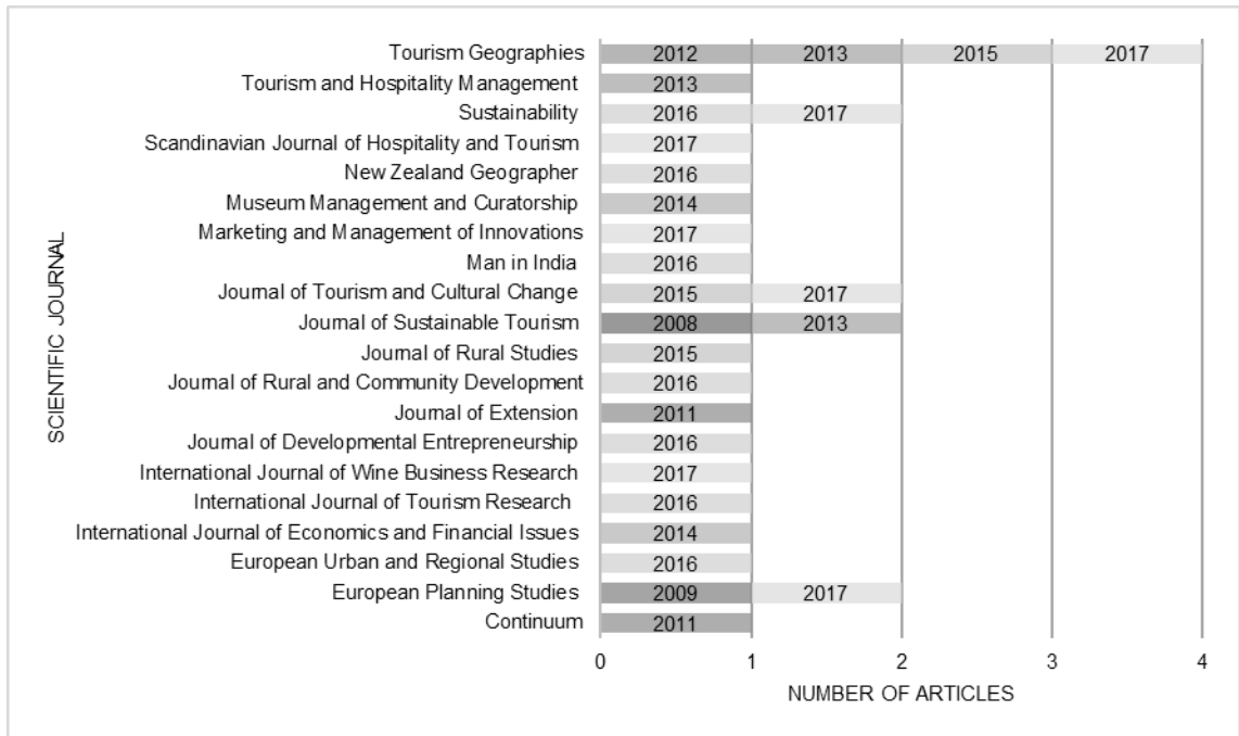
Figure 3. Distribution of the sample per year of publication and per scientific journal

In 2017, an additional seven papers were published, meaning that over half of the sample was published. Thus between 2016 and 2017 the majority of the papers used for this study was published. The journal with the most publications is Tourism Geographies (Figure ). Everett (2008; 2012), Hjalager (2013; 2014) and Lee et al. (2015; 2016) were the authors with the highest number of publications (with two articles each).